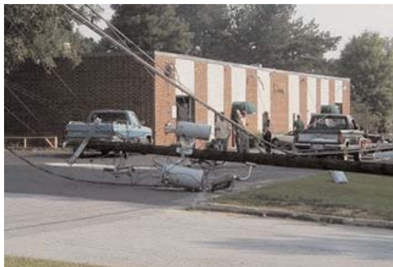
The results of downed wires can be catastrophic. Here, a dump truck pulled down low hanging conductors which resulted in an extensive blackout period for tenants of an industrial park and the potential environmental clean-up.